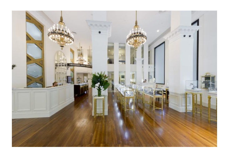
Fairfax & Roberts New Flagship Showroom 19 Castlereagh Street Sydney NSW 2000

Fairfax & Roberts today announced that it has refurbished and reopened its flagship Showroom at 19 Castlereagh Street, Sydney, Australia. Castlereagh Street is the corridor to Sydney's most desired boutiques, fashion and jewellery stores.