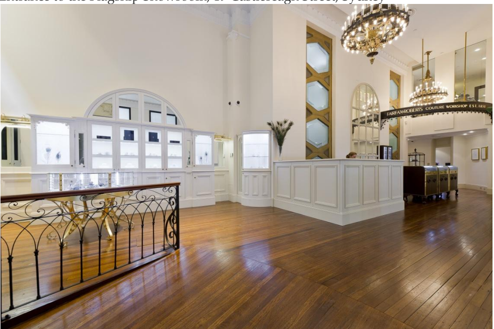
The Diamond Emporium

Entrance to the Flagship Showroom, 19 Castlereagh Street, Sydney